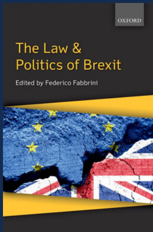
THE LAW & POLITICS OF BREXIT I (OUP 2017)

PRIOR VOLUMES OF THE BOOK SERIES INCLUDE: