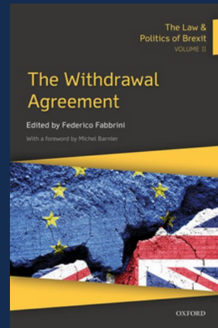
THE LAW & POLITICS OF BREXIT II: THE WITHDRAWAL AGREEMENT (OUP 2020)- FOREWORD BY MICHEL BARNIER , FORMER CHIEF EU BREXIT NEGOTIATOR